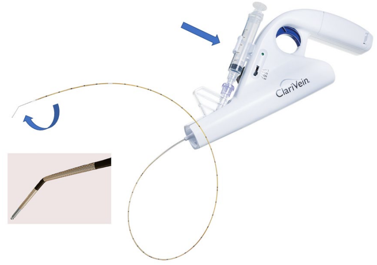
Fig 1: The mechano-chemical ClariVein® ablation catheter has a syringe attached (arrow) through which a sclerosant is injected and an angled rotating tip (curved arrow and inset).<sup>33</sup>

Because of the much more limited approval and