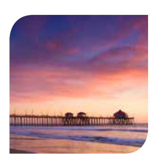
2016 Annual Congress

November 3-6, 2016 Anaheim Marriott Anaheim, CA